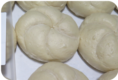
Vacuum conditioning permanently stabilizes the structure and volume of partly baked products