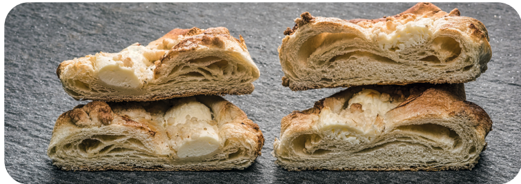
Vacuum conditioning ensures lasting flakiness and prevents fatty bases with fine bakery wares such as croissants or Danish pastries